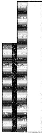
Classic sandwich - a axis