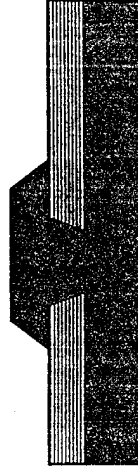
Classic Planar SNS c axis film