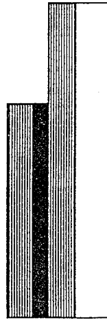
Classic sandwich c axis