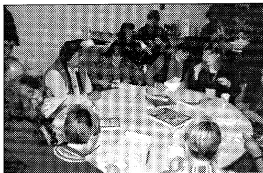
Teachers from across the nation attended Conference Educator Sessions

The National Conference had several educator sessions sponsored by the AISES Department of Research and Evaluation. Presenters included representatives from technology organizations, corporations, federal agencies, and universities and schools across the country, including National Science Foundation, Sandia National Laboratories, and the AISES Board of Directors and staff. The sessions were well at-