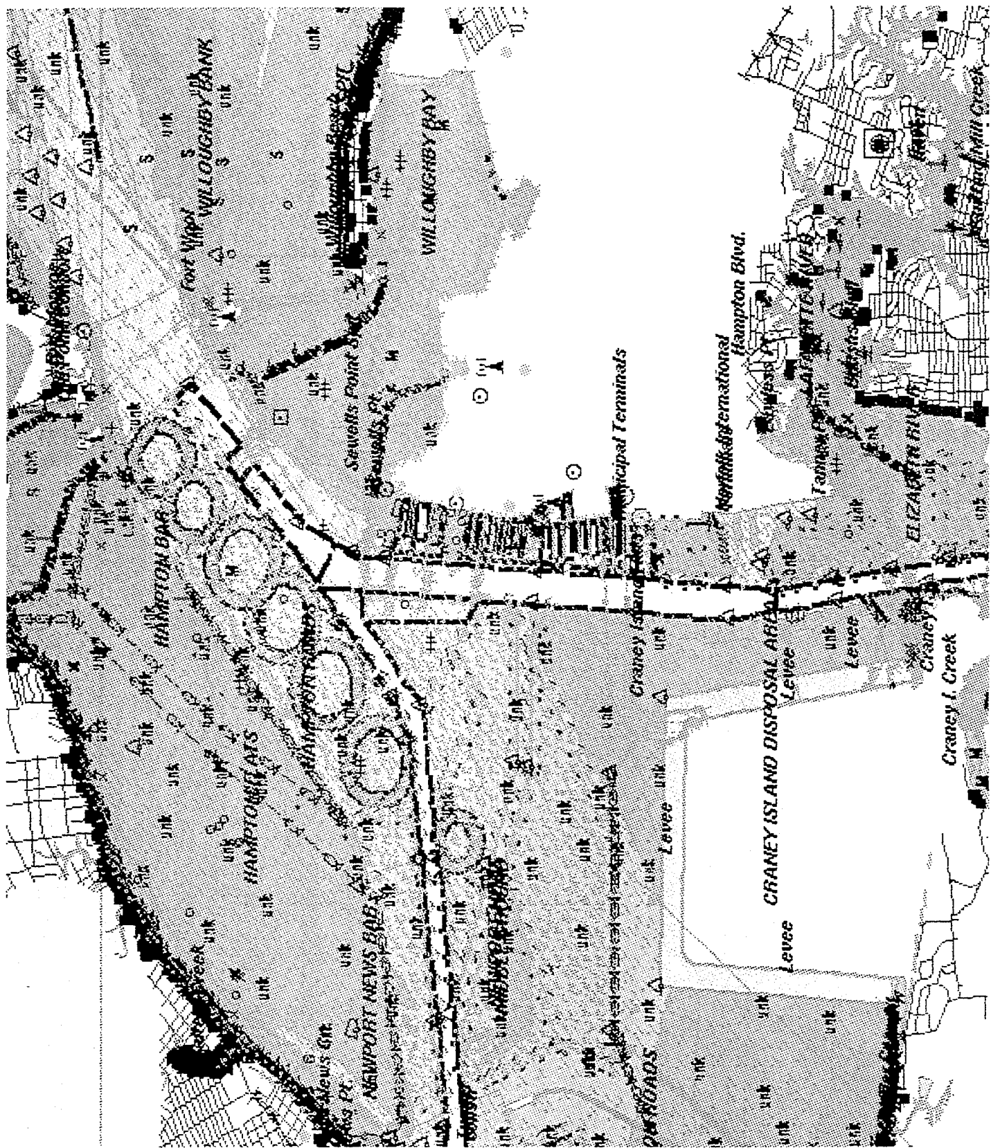
Figure 1. Norfolk Approach created using DNC01.