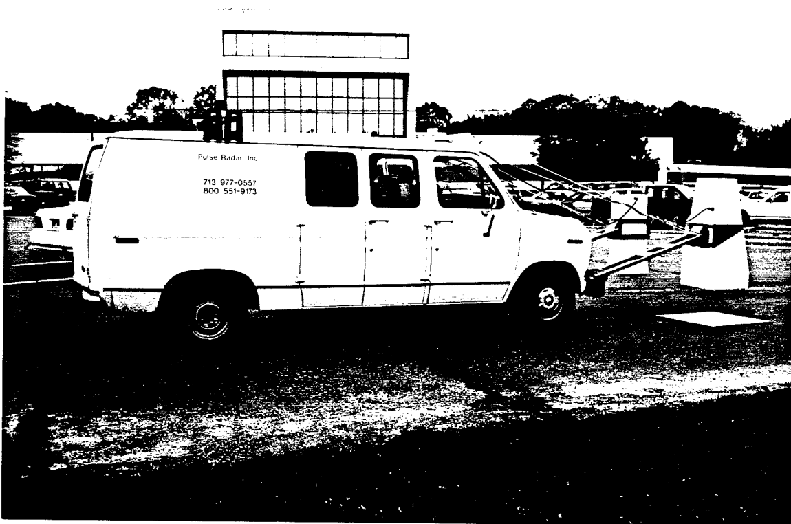
Figure 1. Survey van with antennas mounted