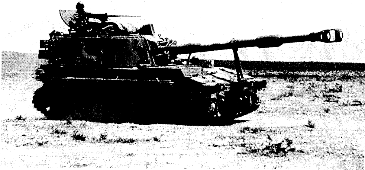
Figure 1. An M109A2 Howitzer