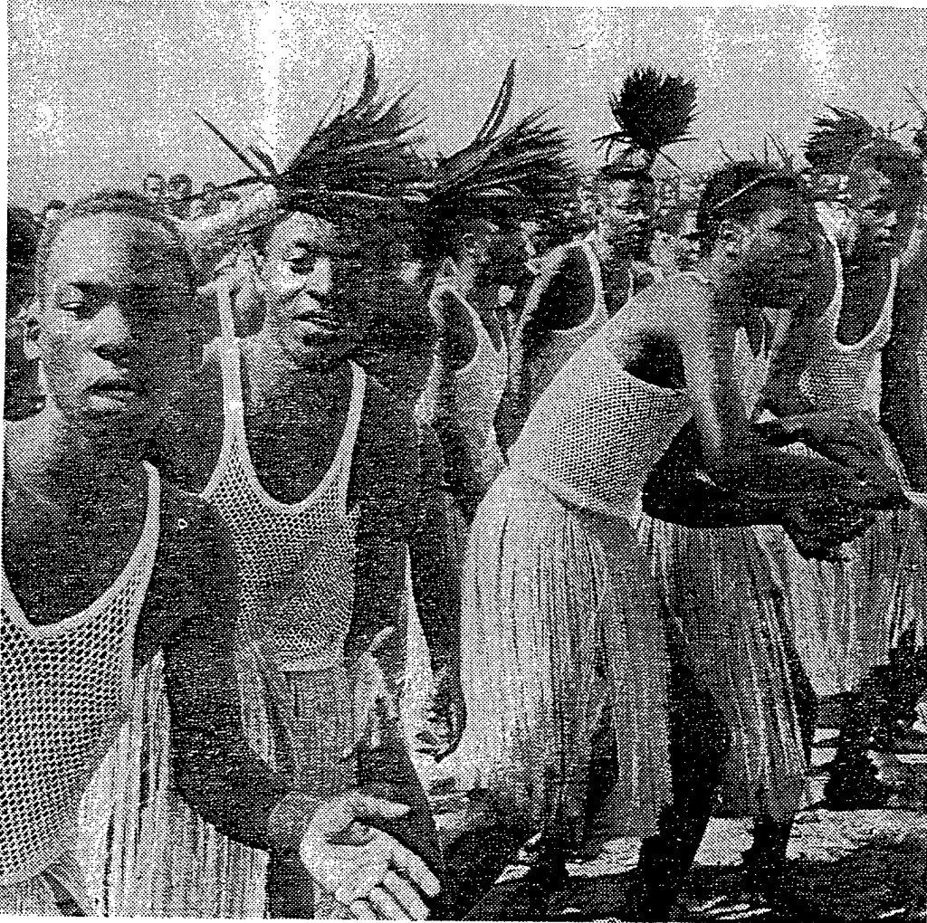
An amateur ensemble of national dances in Burundi. (8 Aug 83, p. 6)