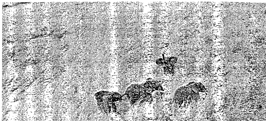
The reserves of the country preserve Africa's wildlife.