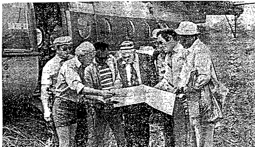
In Ilubabor Province, Soviet specialists help their Ethiopian friends organize new land.