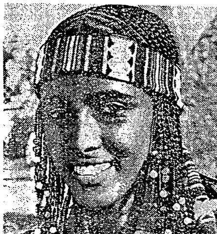
The striking and beautiful attire of a woman in Sidamo Province.