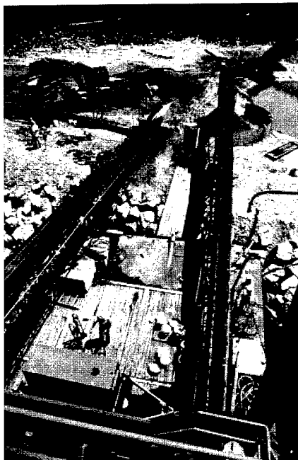
Figure 2. Saginaw River physical separation operation