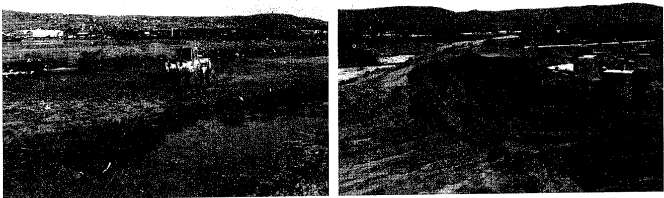
Figure 1. Recovery of coarse sediment (left photo) and stockpiling (right) at Erie Pier CDF soil washing project

The soil washing process has now been incorporated as a contractual requirement of the Erie Pier dredging operation and is