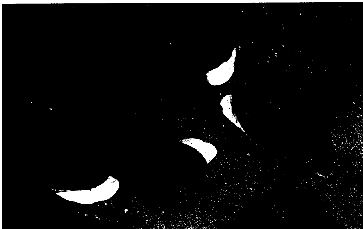
Fig. 1. Pink heelsplitters in the primary stage of TFM intoxication; they have abandoned the normal buried position and lie on the substrate with foot extended.

were more severely affected; 50% of those exposed to 3.5 mg/L responded normally after 7 days, but only 5% of those exposed to 5.25 mg/L responded to external stimuli.