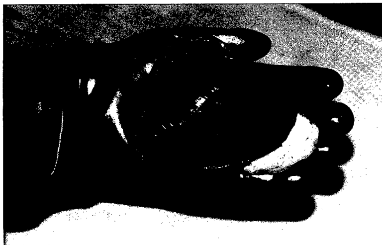
Fig. 2. Pink heelsplitters in the secondary stage of TFM intoxication; they gape their valves and no longer respond to external stimuli.

Fourteen days after exposure, 90% of the mussels exposed to 3.5 mg/L of TFM for 12 h survived, but less than 30% of those exposed to 5.25 mg/L for 12 h or 7.4 mg/L survived (Table 4). As expected,