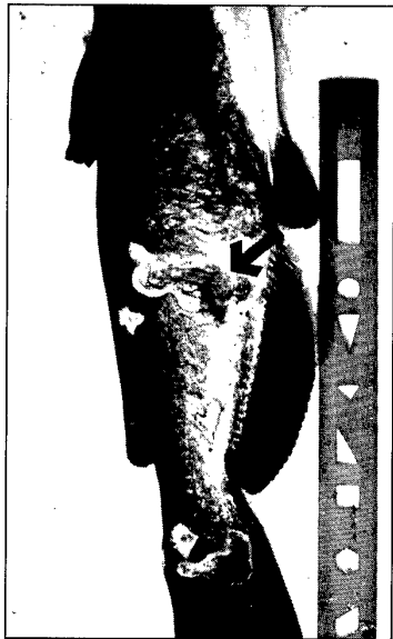
Fig. 2. Aeromonas infection in channel catfish showing eroded skin and muscle (arrow).

In the chronic disease, the predominant clinical signs are dermal ulceration, with hemorrhage and inflammation; the dermis and epidermis are eroded and the underlying musculature is destroyed (Fig. 2).