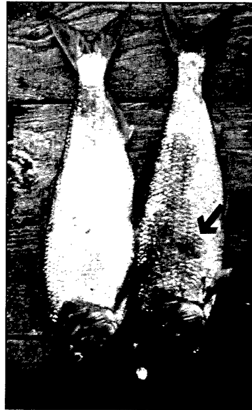
Fig. 1. Aeromonas infection in American shad, showing dark inflamed area (arrow).

The acute form rapidly becomes a fatal internal infection. Externally, it is accompanied by protrusion of the eyes and reddening of the skin (Fig. 1). The liver may become pale or green and the kidneys swollen, seemingly in reaction to bacterial toxins. Tiny pinpoint hemorrhages sometimes occur throughout the body wall and organs. The intestine and lower vent are often swollen, inflamed, and hemorrhagic; additionally, the intestine is devoid of food and filled with a yellow mucus-like material.