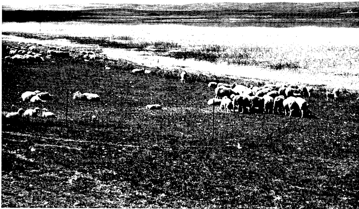
Fig. 3. Long-term overgrazing can destroy nearly all emergent vegetation in those shallow prairie wetlands having firm bottom soils. (Dickey Cty., North Dakota, 9 miles northwest of Forbes)

Much more is known about the effects of grazing than of burning on wetland plant communities. Unless unusually severe, grazing results in greater plant species diversity and the development of more intricate patterns and sharper boundaries among plant communities (Bakker and Ruyter 1981). Livestock trampling may affect the height and density of wetland vegetation more than consumption (Hilliard 1974). Overgrazing may cause a decrease in primary production (Reimold et al. 1975), an increase in water turbidity (Logan 1975), and areas devoid of vegetation (Bassett 1980), as shown in Fig. 3. Adaptations of wetland plants to grazing include nodal rooting and unpalatability (Walker 1968; Walker and Coupland 1968). Marshes often show greater vegetative response to grazing than upland communities (Bassett 1980). Lists of species that increase or are tolerant of grazing in wetlands in or near the prairie pothole region have been published by Evans et al. (1952), Smith (1953), Harris (1954), Smeins (1965), Dix and Smeins