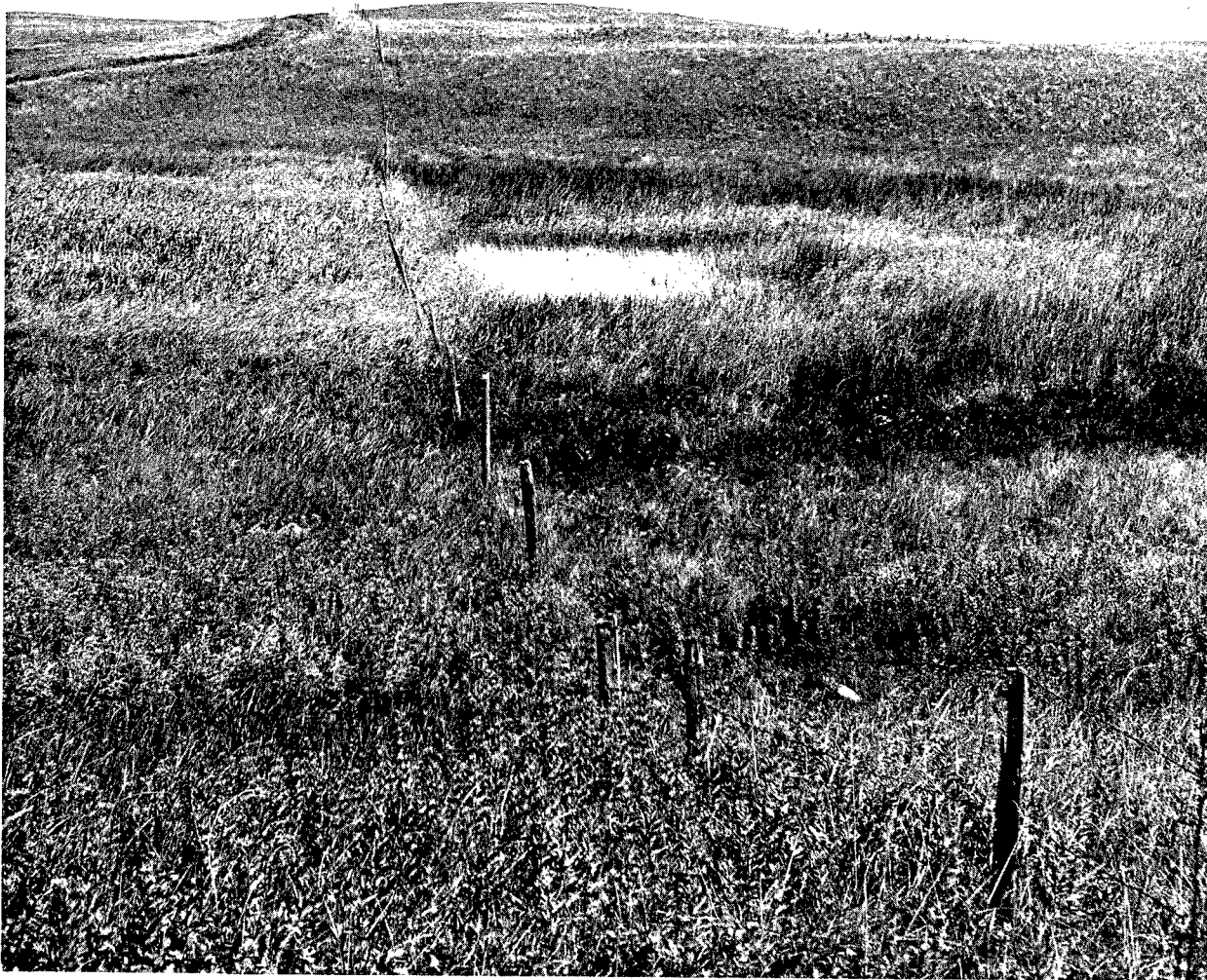
Fig. 4. Moderate cattle grazing created the semiopen and more diverse plant community shown on the right side of the fence; the portion on the left remains idle. (Stutsman Cty., North Dakota, 2.5 miles east-southeast of Woodworth)

growth in sparse stands caused by grazing also provided the best brood habitat on eastern Montana stock ponds (Smith 1953). Harris (1954) observed that heavily grazed areas dominated by Scirpus spp. and Juncus spp. received the most use by broods in Washington potholes. Overgrazing, especially of small wetlands, created unsuitable brood habitat in South Dakota (Evans and Black 1956). Keith (1961) noted a large increase in brood density after partial destruction of Typha spp. stands by herbicides on Alberta impoundments, and he recommended combining grazing and herbicide applications to rejuvenate marsh