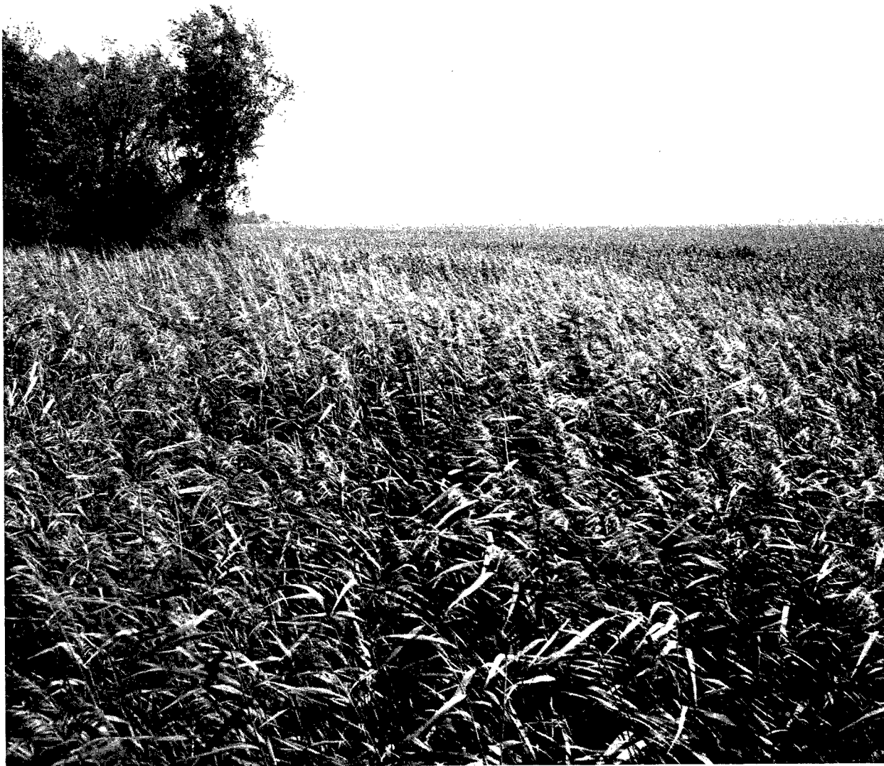
Fig. 1. A prairie wetland unburned for more than 45 years; dense stands of Phragmites australis (foreground) and Typha angustifolia (background) lie offshore from the wet-meadow zone, which is dominated by a mature stand of Salix amygdaloides . The area has seldom been grazed by livestock. (Roberts Cty., South Dakota, 6 miles southwest of Rosholt)

buildup of litter and organic material from emergent species may reduce water depth or eliminate shallow water areas (Ward 1942; Walker 1959; Hammond 1961; Ward 1968; Beule 1979). Buildup of litter and the shading effect also may result in lower soil or water temperature and slower rates of plant decomposition (Willson 1966; Godshalk and Wetzel 1978). Various emergent species may decompose at different rates as the result of differences in species composition of macroinvertebrate populations (Danell and Sjöberg