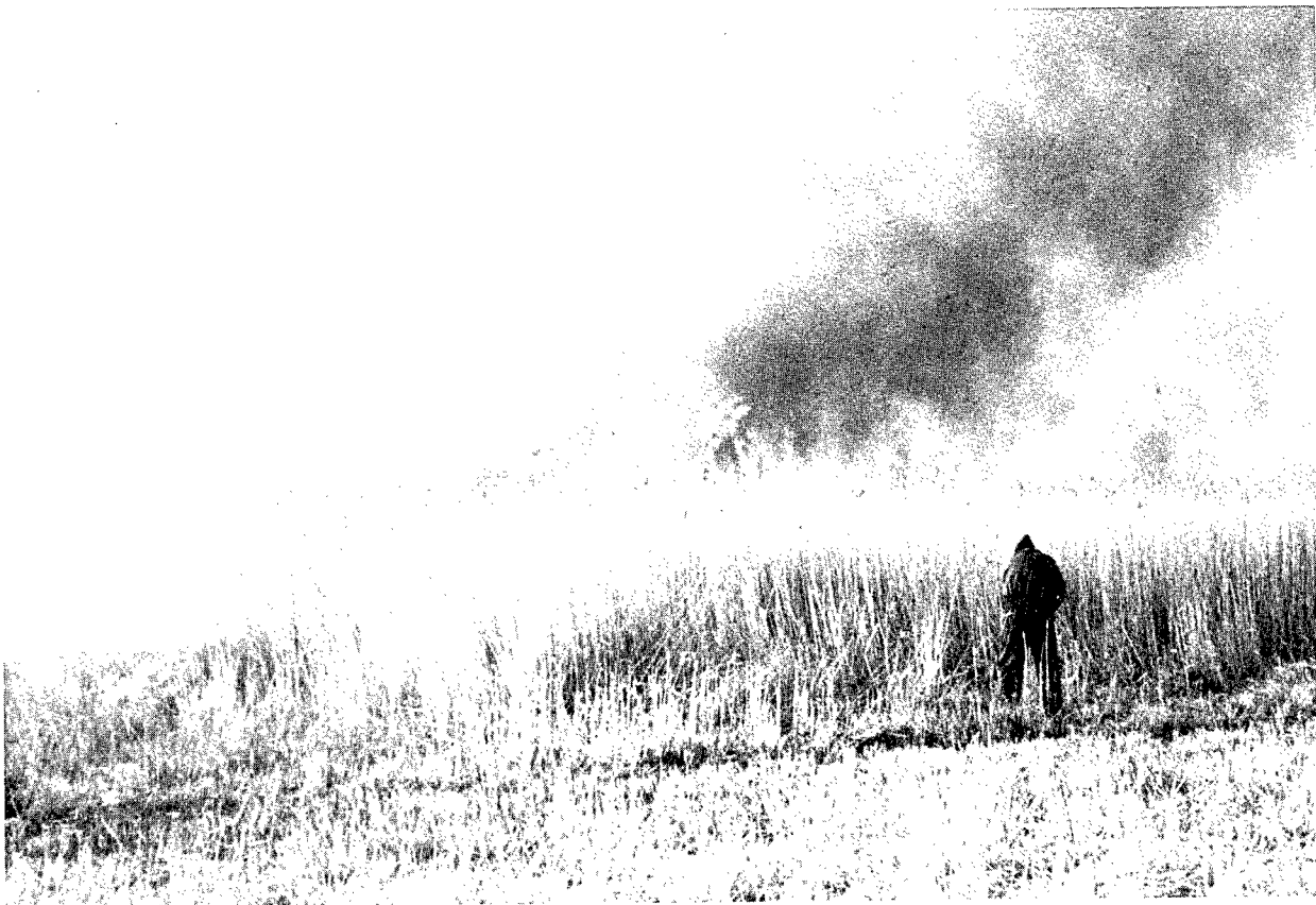
Fig. 2. Prescribed spring burn being used to open a dense stand of Phragmites australis on the J. Clark Salyer National Wildlife Refuge. (Bottineau Cty., North Dakota, 4.5 miles southeast of Westhope; photo by R. Giese.)

Only a few experimental marsh burns have been conducted to study the effects on breeding waterfowl. Ducks showed increased use of winter-burned stands of P. australis and Scirpus acutus in wetlands in the Nebraska Sandhills (Schlichtemeier 1967). Ward (1968) found that in a Manitoba wetland fire opened up old stands of P. australis that formerly were almost devoid of duck nests and stimulated growth of Scolochloa festucacea , which supported highest duck nest densities. However, duck nest success was low the first year after a fire on low, Poa pratensis prairie in Iowa (Messinger 1974). A more detailed study was conducted by Björk (1976), who observed that in a Swedish wetland "severely damaged" by overgrowth of Phragmites australis and Carex acuta , burning and