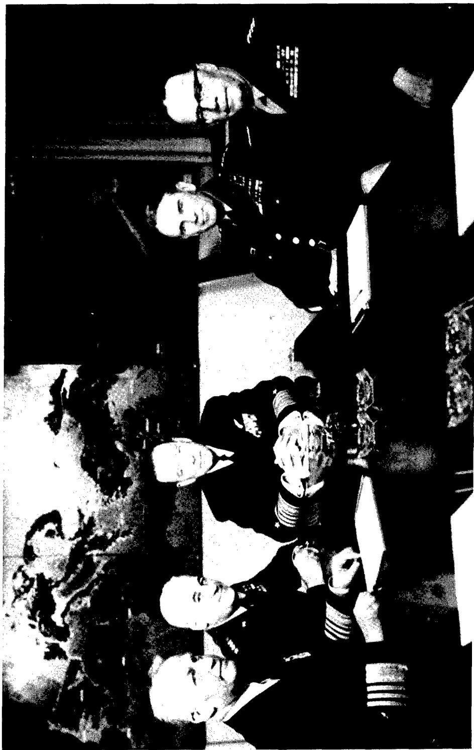
The Joint Chiefs of Staff in March 1956. Left to right: Admiral Arleigh A. Burke, Chief of Naval Operations, USN; General Nathan E. Twining, Chief of Staff, USAF; Admiral Arthur W. Radford, USN, Chairman, JCS; General Maxwell D. Taylor, Chief of Staff, USA; General Randolph McC. Pate, Commandant, USMC.