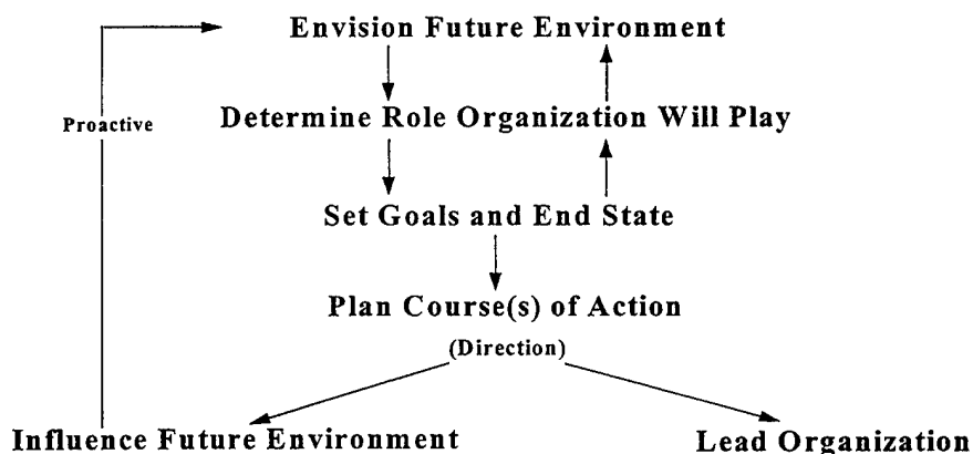
Figure 3. Strategic Vision Concept

The Army Personnel Community’s current information management operational mode is mainframe-centric, closed-system, Service-specific (and, at times, component-specific), batch-oriented technology and processes. The current industry standard is network-centric, open-systems, interactive, Internet/Intranet processes with graphical user interface (GUI) capability.” 43 PERSCOM PERSINSD envisions “one integrated personnel information architecture...responsive, accurate, timely, and reliable.” 44 From this information, a vision of the year 2001 environment and the role the Army will or