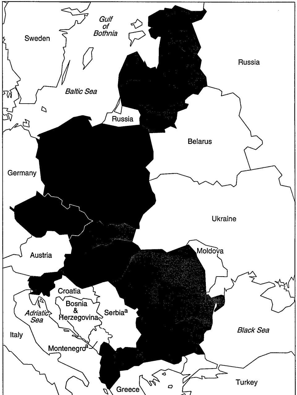
Figure 1: States Invited to Join and Interested in Joining NATO