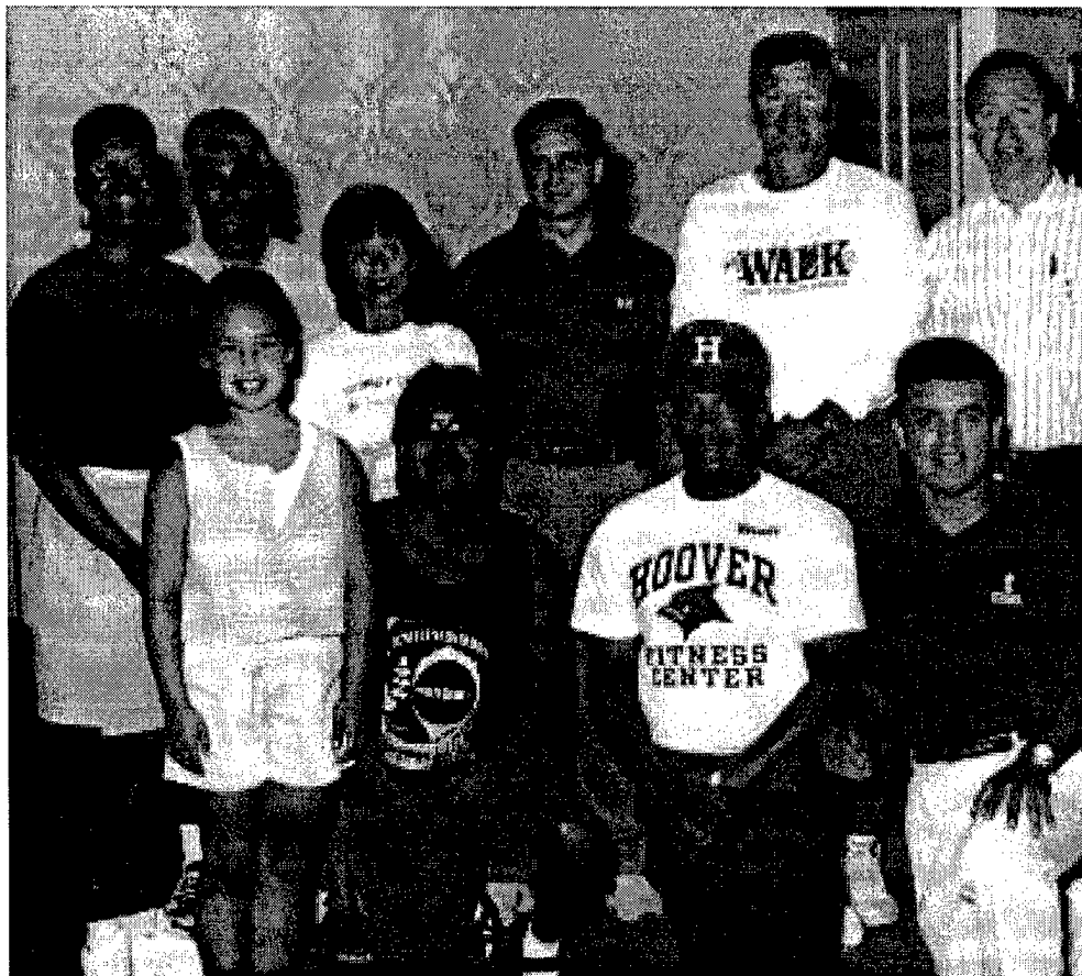
Some of the representatives from 10 exemplary physical activity programs, and others who received individual recognition, gathered for a photograph during last summer's press conference.

and maintain independence is important, especially for older adults."