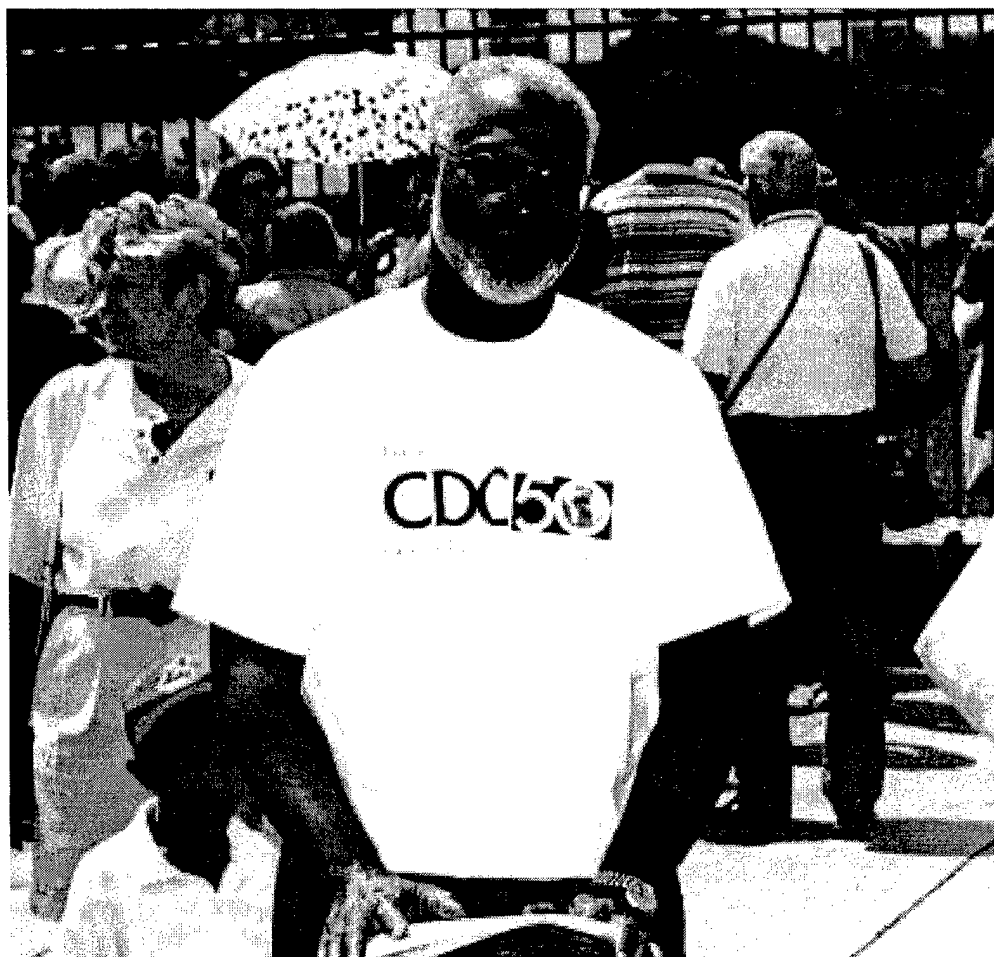
David Satcher, MD, MPH, Director, CDC, shown at the July press conference for the release of Physical Activity and Health: A Report of the Surgeon General , challenged the agency's employees to set physical activity goals in a successful, low-cost worksite health promotion campaign during spring 1996.

"Physical activity is not something that you need a gymnasium for or membership in a club that costs $1,000 a year."