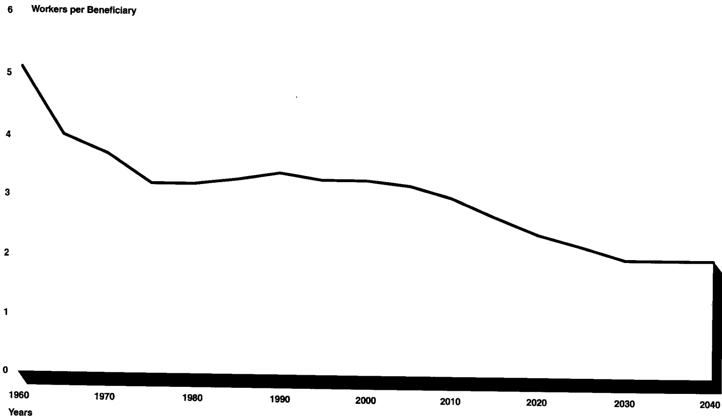
Figure 2: Workers Contributing to Social Security Per Beneficiary, Historical and Projected, 1960-2040

Note: Projections use SSA's intermediate actuarial assumptions.