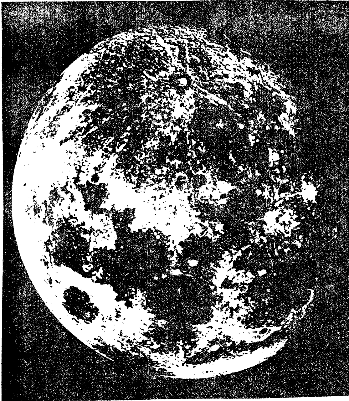
Photograph of the Visible Part of the Moon, Made on the Earth by Means of a Powerful Telescope.