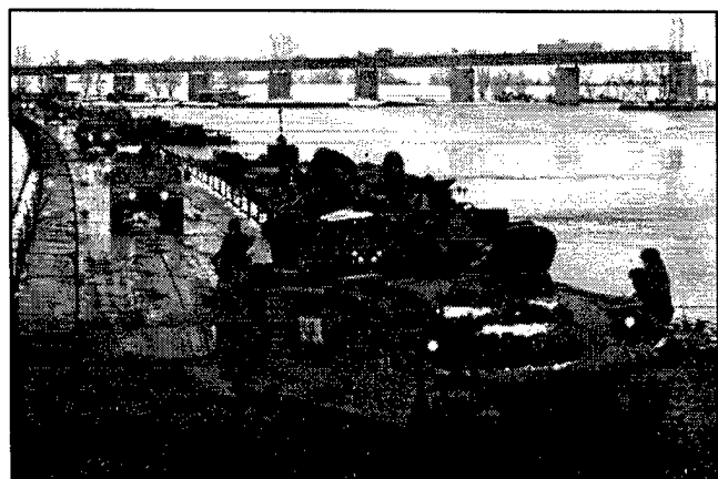
U.S. Army forces like these in Bosnia, appear to be the likely billpayer for budgetary and force cuts contemplated under the Quadrennial Defense Review.

Despite the projection of a flat defense budget, which will actually reflect a decline in spending when the effects of inflation are considered, the QDR apparently will codify an expansive U.S. military strategy, an increased pace of equipment modernization, and a deepened commitment to innovation in military technology, organization and doctrine. According to press accounts, the price for trying to increase spending on long overdue equipment modernization is certain to be significant cuts in the size and structure of current U.S. military forces - forces that have already been cut by one third just since the end of the Gulf War. The Washington Post reported on May 7 that Secretary Cohen has approved a cut of up to 60,000 active-duty personnel, 70,000 reservists and 80,000 civilian defense workers across all the services. The strategy appears increasingly ambitious while military personnel levels, force structure, and budgets shrink.