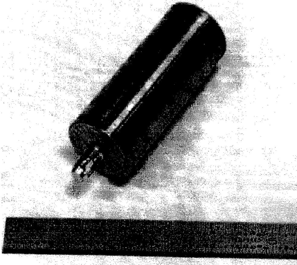
Typical 5-curie Plutonium-Beryllium Neutron Source