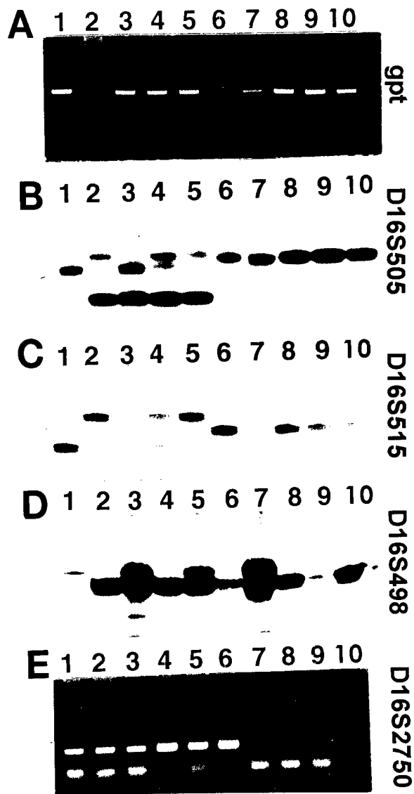
Fig. 4. Analysis of microcell hybrids for donor chromosome 16 specific markers: RA16, donor mouse/human monochromosomal hybrid containing intact 16 (lane 1), MCF-7 (lane 2), MCF-7/16, senescent hybrid of MCF-7 carrying intact 16 (lane 3), MCF-Rev1, revertant clone from a senescent hybrid (lane 4), MCF-Rev2, revertant clone from a different senescent hybrid (lane 5), SKBR-3 (lane 6), SKBR/16, senescent hybrid of SKBR-3 carrying intact 16 (lane 7), SKBR-Rev1, revertant clone from a senescent hybrid (lane 8), SKBR-Rev2, revertant from another senescent clone (lane 9), SKBR-Rev3, another revertant clone from a different senescent hybrid (lane 10). PCR amplification of a 787 bp gpt sequence (A), analysis of polymorphic dinucleotide (CA) n repeats for loci D16S 505 (B), D16S515 (C) and D16S498(D). Molecular analysis of immortal revertants of senescing microcell hybrids of rat breast cancer cells for D16S2750 (E). RA16, (lane 1), 16A3-1, donor mouse/human monochromosomal hybrid containing fragment of chromosome 16q 22-qter (lane 2), 16A2-2, donor mouse/human monochromosomal hybrid containing fragment of chromosome 16q 23-qter (lane 3), LA7/16, senescent rat breast tumor cells containing intact chromosome 16 (lane 4), LA7/16A3-1, senescent rat tumor cells containing chromosome 16q 22-qter (lane 5), LA7/16A2-2, senescent rat tumor cells containing chromosome 16q 23-qter (lane 6), Rev1 (lane 7) and Rev2 (lane 8), revertant clones from senescent clones containing chromosome fragment 16A3-1, and, Rev3 (lane 9), revertant clone from senescent clone containing chromosome fragment 16A2-2, all three showing the absence of the marker D16S2750, LA7, rat mammary tumor cell line (lane 10).