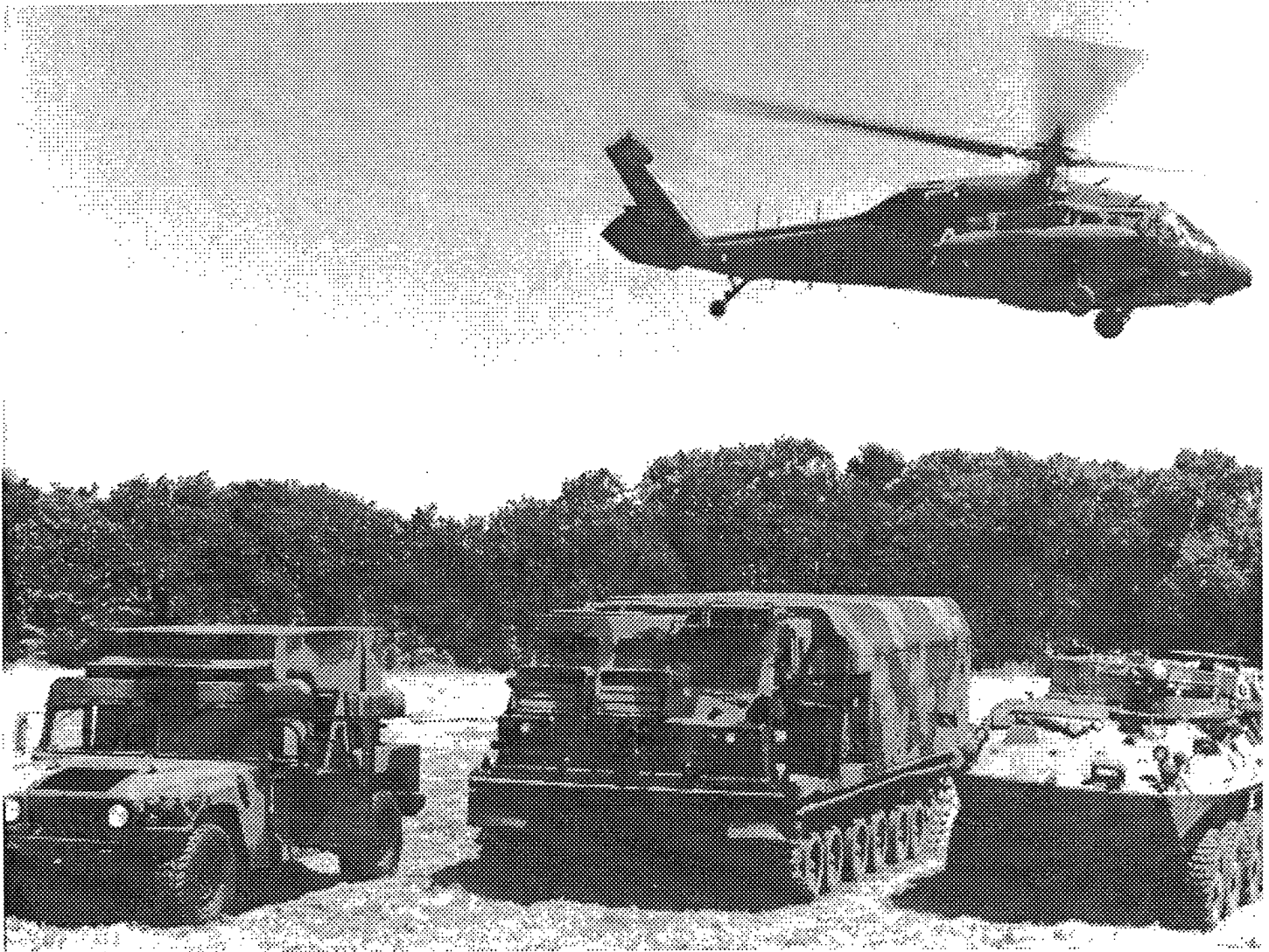
Figure 1: EH-60 Helicopter Hovers Over (l. to r.) Army Light and Heavy and Marine Corps Light Armored Vehicles