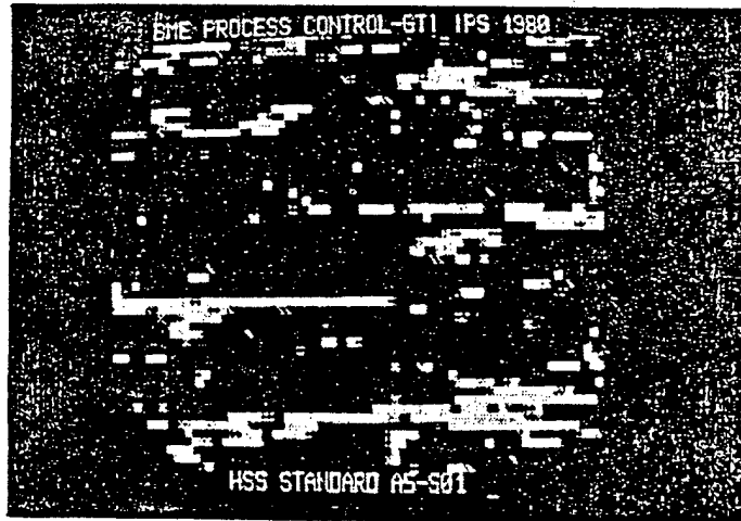
Figure 2: Image of Metallographic Section During Processing