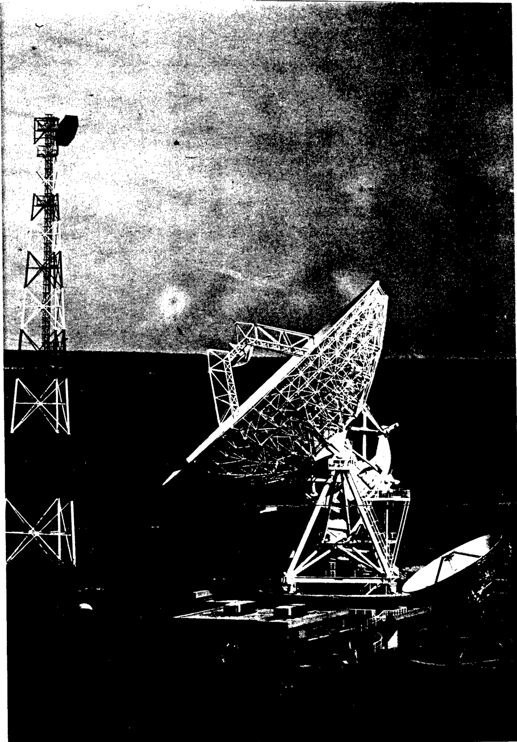
The international satellite earth station at Karma. It will provide telephone and television links throughout Nigeria and with the entire world.