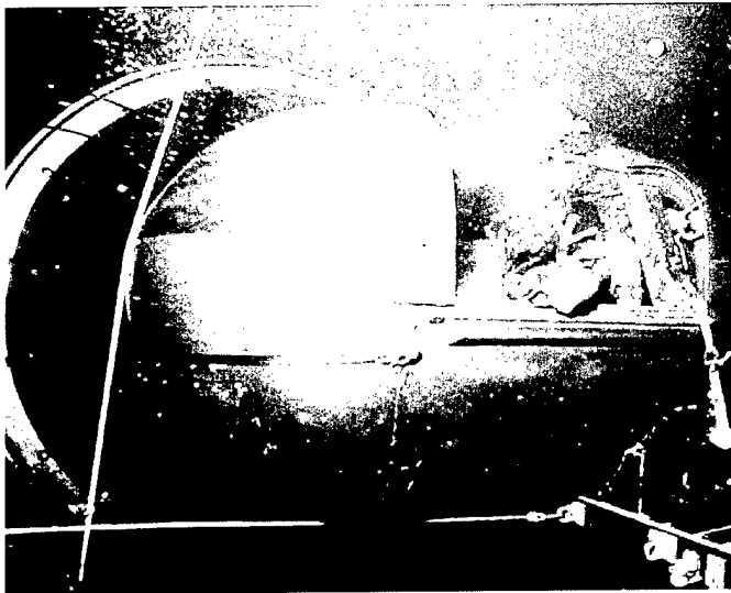
SEAL Delivery Vehicle disembarking Dry Deck Shelter

Seventy-eight percent of the SEALs in the study reported taking at least one nutritional supplement during the past year. The majority reported