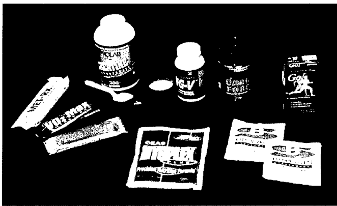
Over-the-counter nutritional supplements

There is a common belief among many athletes and military personnel that nutritional supplements enhance performance. Several studies have reported a high frequency of nutritional supplement use among athletes, and some nutritional