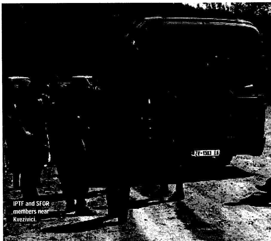
IPTF and SFOR members near Kvezivici.

The greatest hinderance, however, was the issue of where (in what municipality) individual votes would be applied. At least 1.5 million voters had relocated. Obviously they were fleeing the conflict. Some went to foreign countries while others moved to areas controlled by soldiers of their own ethnic background. The agreement contained a general rule that individuals