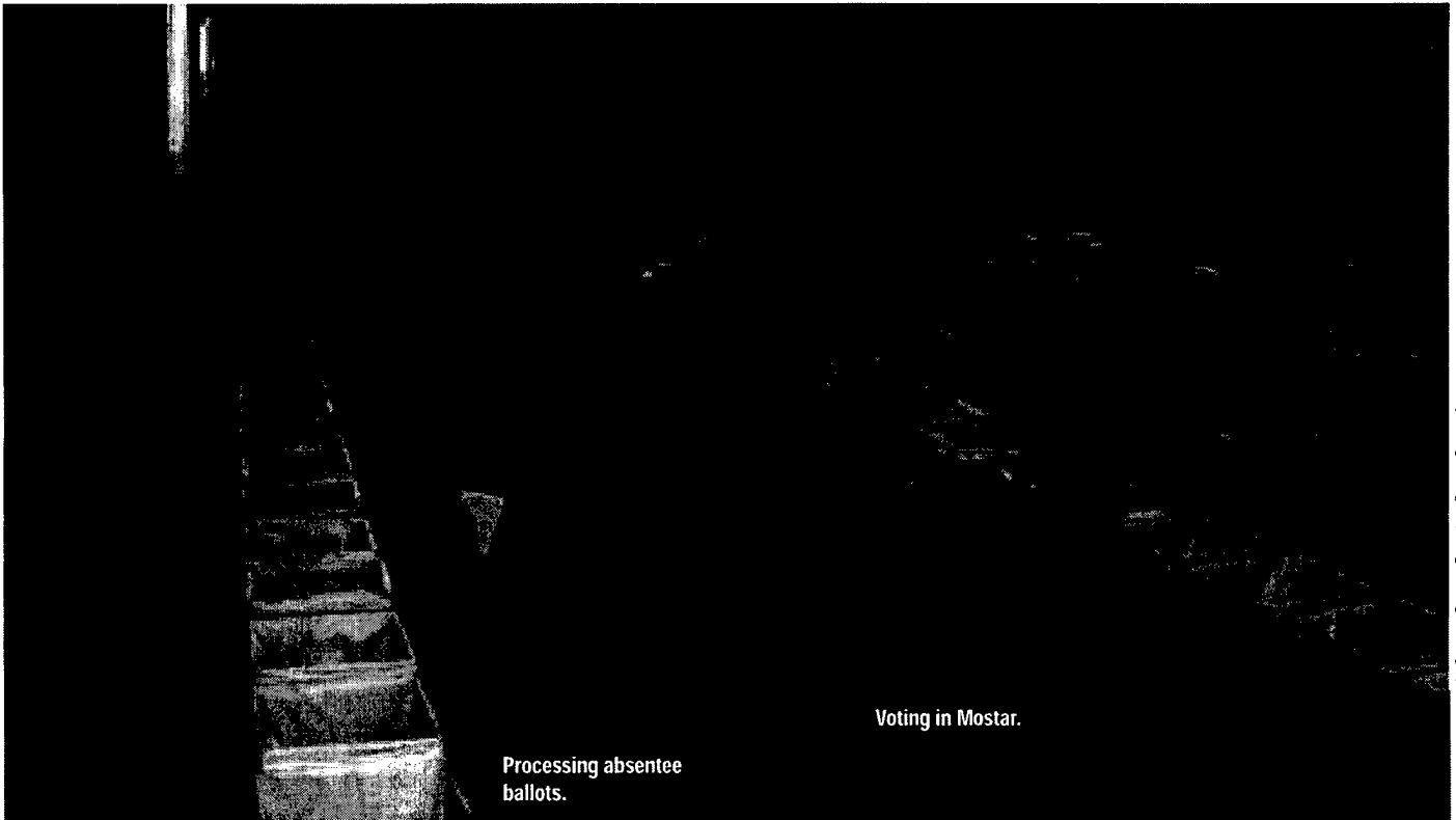
Processing absentee ballots.