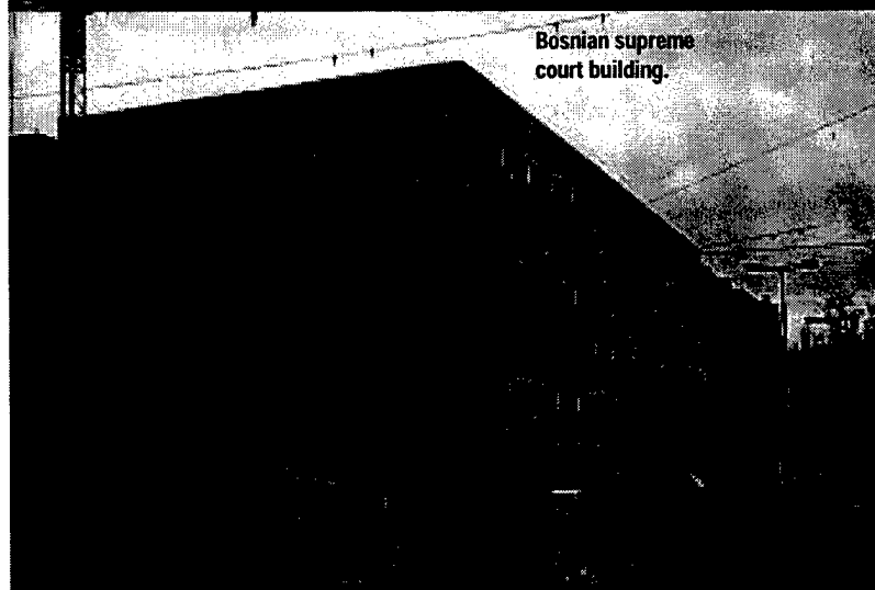
Bosnian supreme court building.