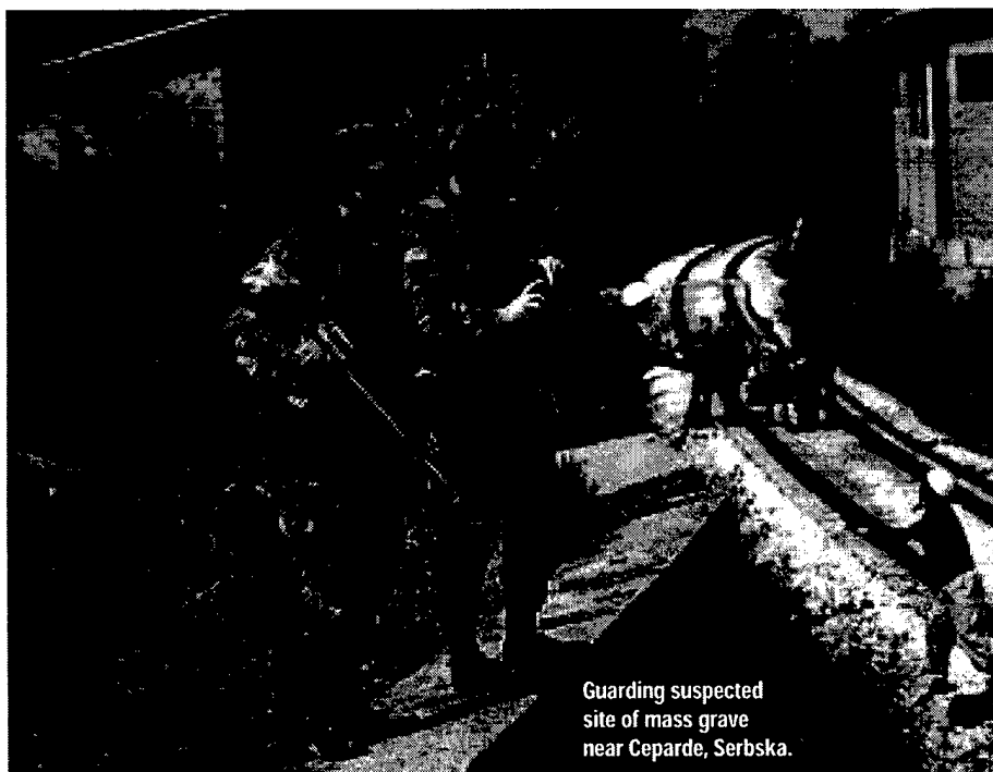
Guarding suspected site of mass grave near Ceparde, Serbska.