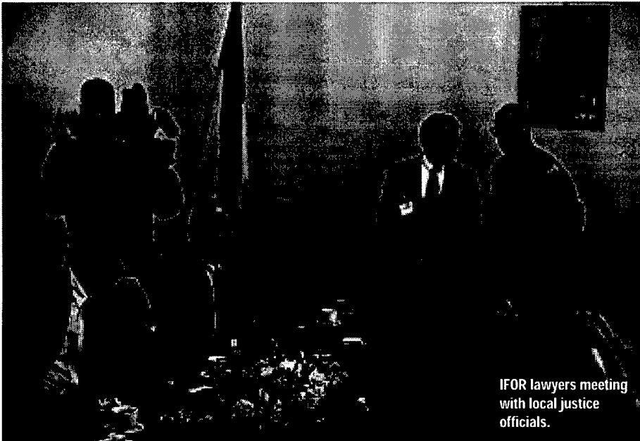
IFOR lawyers meeting with local justice officials.