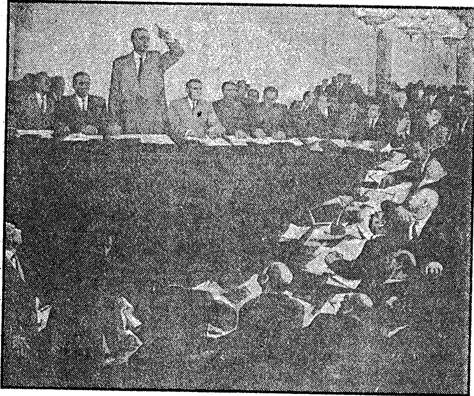
An Albanian Work.