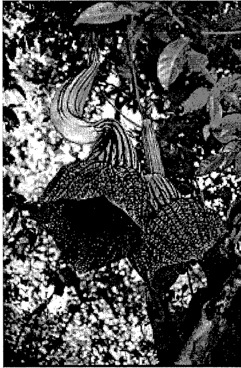
Figure 3: The President's flower

Also in May, the Divisional Officer and other departmental heads for the Mundemba Center visited the site to attend a ceremony for the enumeration completion of the plot's first 25 ha. The Directing Officer remarked that he is pleased with the project as a whole, and urged the full support of the surrounding community for the project.