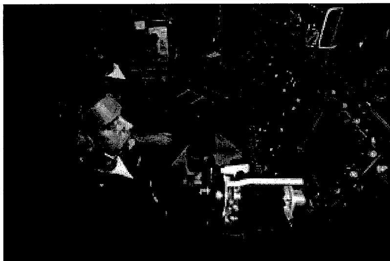
USS Seawolf