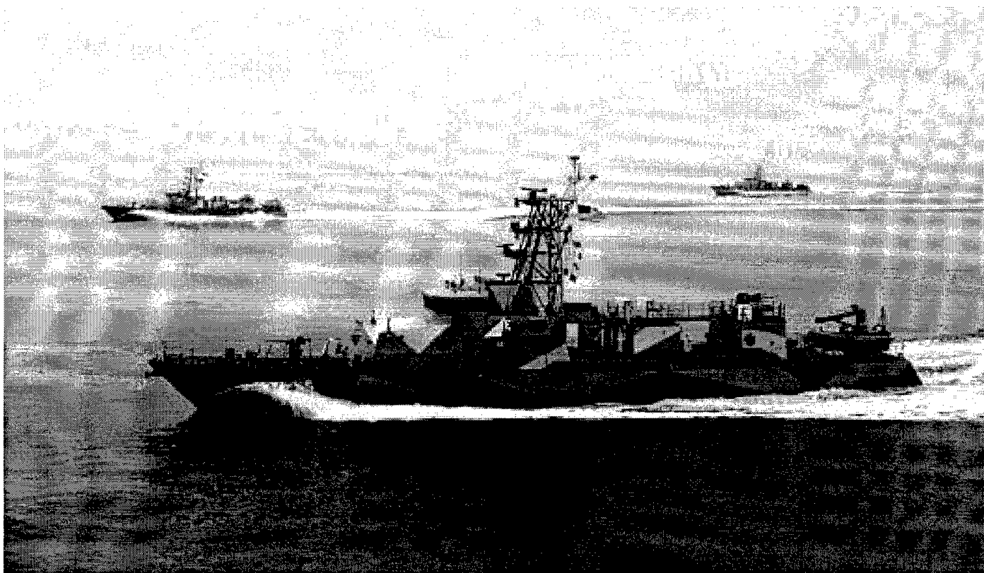
U.S. Navy (Jeffery S. Viano)