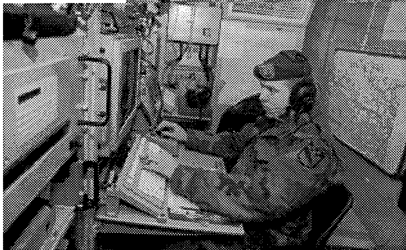
59 th Signal Company, Combat Camera