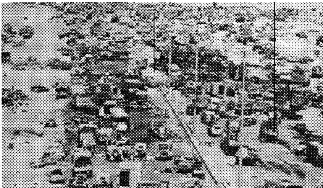
The Highway of Death. With JSTARS, US forces now possess the unprecedented ability to reliably detect, accurately locate, precisely track, and, if appropriate, target in real time almost all the unscreened vehicular movement of opposing forces that is occurring within an area exceeding 40,000 square kilometers, even if this movement takes place at night or during bad weather.

The joint force commander and his component commanders must remain responsible for the higher-level battle management activities, managing the planning and execution of warfare at the operational and tactical levels to include oversight of engagements. These commanders are the ones who determine a joint interdiction campaign's objectives, conceive concepts of operations for employing their forces to achieve those objectives, prepare plans to implement those concepts, assign resources to execute the plans, and oversee execution of the plans, to include dynamically modifying their plans and reassigning resources to ensure the crea-