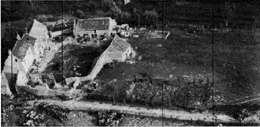
German convoy destroyed around a farmhouse in Normandy, 1944. German commanders believed that one of the most important contributions made by Allied airpower in World War II, especially in Normandy, was through its impact on the German army's daytime movement.

accurate/timely situational awareness was always available and in sufficient detail to highlight opportunities when offensive action could have led to prompt victory. At no time did the brigade assault with unexpected, overwhelming maneuver to decisively overwhelm the enemy. For whatever reason, leaders did not demonstrate the capacity to recognize or seize these opportunities. Instead, attritional/high casualty warfare was always favored. 11