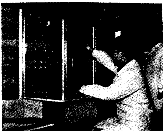
A simulation computer