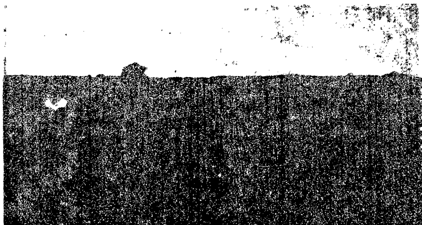
Ruins of adobe buildings which serve as retreat for ticks -- carriers of tick relapsing fever.

The great and universally recognized merit of the Academician Ye. N. Pavlovskiy was the organization of over 200 expeditions which embraced in their activity the republics of Central Asia, Transcaucasia, Far East, Zabaykalye, Siberia, central and northwest regions of the RSFSR, Crimea and Zakarpat'ye.