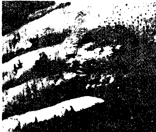
A hand with multiple affections of the Oriental sore

Black Sea-Caucasian shore and in Azerbaydzhan. Further investigations led to the discovery of natural nidi of tick exanthemaous-like fevers in Siberia, Zabaykal'ye, in the Far East and in Kazakhstan. The nidi of these fevers are located predominantly in the steppe territories where the Ixodes (pasture) ticks of the dermaceptor and hemaphysalis species are prevalent. The causative agents of tick exanthematous-like fevers -- Rickettsiae -- remain for long periods of time in the body of ticks, proliferate in the cells of their internal organs, enter the salivary glands of the parasites, and are transmitted by the infected females through their ovaries to four or five descending