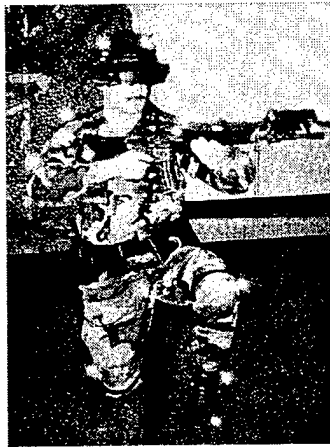
Figure 2. Soldier in DSS with sensors, M16 rifle, and helmet-mounted display.

Soldier Visualization Station. The Soldier Visualization Station (SVS), made by Reality by Design, Inc., is also a virtual environment simulator directed toward individual combatants. The assessment considered three configurations of the SVS: (a) the base system, (b) a panoramic display option, and (c) a configuration where movement is controlled by a treadmill.