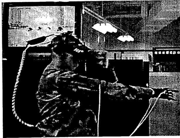
Figure 1. Soldier in TactX with helmet-mounted display and instrumented glove.

phase. In the scenario, the leader controlled two teams in a squad. Tools included a map, binoculars, radio, weapons, and the global positioning system (GPS).