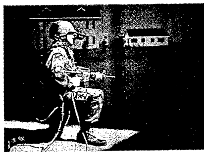
Figure 3. Soldier in SVS with M4 rifle, IHAS, and flat-projection screen.

The base version of SVS projects a virtual environment terrain display on a flat screen. A thumb switch on a realistic replication of the M4, Land Warrior rifle controls movement. The thumb switch functions like a joystick to control direction and rate of movement. In the base system, the display is sensitive to the actual posture of the soldier being trained, for example, standing, kneeling, and prone. The system is configured to simulate Land Warrior technology, which incorporates a weapon-mounted video camera that feeds to the Integrated Helmet Assembly Subsystem (IHAS) display. The base system is shown in Figure 3.