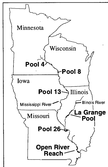
Figure 1. Long Term Resource Monitoring Program (LTRMP) study areas of the Upper Mississippi River System. Graphic by Todd M. Koel, Illinois Natural History Survey, Havana, Illinois.

The Spatial Query Tool (Figure 2) integrates the LTRMP component data with spatial data layers and allows the