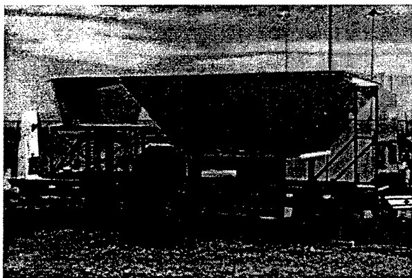
Figure 1. Remote sensors mounted on flatbed trailer. From left to right: Ceilometer, sodar, and radar.

The radar, sodar, and ceilometer are mounted on a 7-m flatbed trailer. The radar sits on the front end of the trailer with the sodar in the rear. The ceilometer resides near the back edge of the trailer (Figure 1). Leveling of the trailer and sensors is accomplished with seven jacks mounted along the sides and front of the trailer.