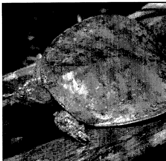
Smooth Softshell Turtle

BACKGROUND: Changing water levels or other operations at U.S. Army Corps of Engineers (USACE) reservoirs may impact critical habitat parameters for softshell turtle species. This technical note identifies softshell turtle species and habitats potentially impacted by USACE reservoir or other water-control projects as reported by resource managers (Table 1). Current state and/or Federal legal protection status is summarized as is the distribution of USACE Districts and reservoir projects potentially impacted by softshell turtle conservation issues (Figure 1, Table 2). Life-history summaries and habitat requirement descriptions are given for each softshell turtle species identified as potentially impacted at reservoir operations. This group of peculiar-looking turtles includes four species with legal protection in at least one state and none with Federal protection status. Three of these species are associated with environmental issues at six USACE projects from three USACE Districts (3 USACE Divisions).