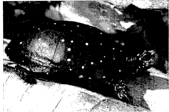
Spotted Turtle

BACKGROUND: Changing water levels or other operations at U.S. Army Corps of Engineers (USACE) reservoirs may impact critical habitat parameters for wetland turtle species. This technical note identifies wetland turtle species and habitats potentially impacted by USACE reservoir or other water-control projects as reported by resource managers. Current state and/or Federal legal protection status is summarized and USACE Districts and reservoir projects potentially impacted by wetland turtle conservation issues are identified (Table 1). Life-history summaries and habitat requirement descriptions are given for each wetland turtle species identified as potentially impacted at reservoir operations (Figure 1, Table 2). This group includes one Federally threatened, one Federal candidate, and three state protected turtle species. These five species were reported to have presented conservation issues at 50 USACE projects from 8 USACE Districts (4 USACE Divisions).