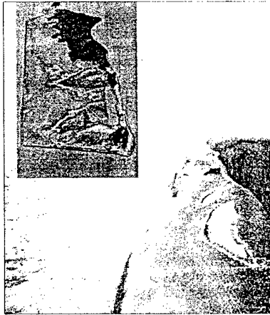
Figure 1. Geotextile tube deployed in field, with S. alterniflora to right and open water to left; inset shows dredged material island with geotextile tubes

BACKGROUND: Geotextile tubes are polypropylene or polyester tubes, typically 100–1,000 ft (30–300 m) long and 8 to 45 ft (2.4–14 m) in circumference (Figure 1). These tubes can be filled with sand and used as semipermanent, nearshore, low-crested breakwaters that protect wetlands from erosion and as containment dikes for dredged material that can be used to create wetlands. Geotextile tubes are positioned empty and then filled by inserting a dredge discharge pipe into ports on the tops of tubes. A typical geotextile tube would sit on top of a scour apron held in place by anchor tubes (Figure 2).