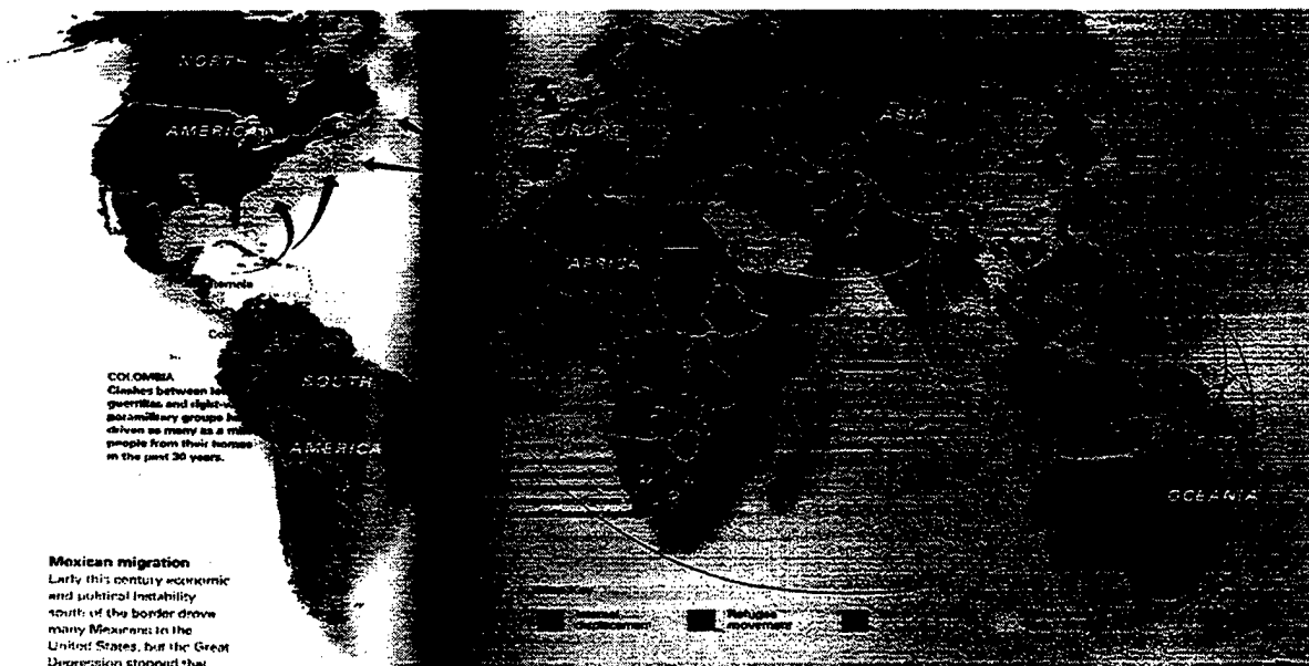
Figure 3 Nation of Migrants

The general economic conditions have led to an underground economy with opportunities for illegal immigrants. A major limitation concerning studies of the black labor market is lack of reliable data. The authorities in Spain, Italy and France have several times in recent years introduced regularization measures to register illegal immigrants and encourage them to become