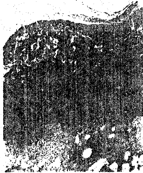
Fig. 2. Extensive hemorrhages into the tissue of the autograft end and the "connecting" layer. (Irradiated piglet seven days after the graft; 11 days after irradiation. Staining with hematoxylin-picrofuchsin. Magnification 80 X.

necrotic part of the epithelium. Such a weakly pronounced inflammatory reaction at the site of injury depended most likely on the marked depression of the functions of the hemopoetic organs and particularly of the bone marrow. In the latter, a picture of complete "devastation" and extensive hemorrhages was seen during this period. The composition of the peripheral blood was a mirror of the condition of the hemopoetic organs. During the most pronounced symptoms of the acute radiation sickness, the number of leucocytes in the blood decreased by 80 to 90 percent as compared with the initial values.