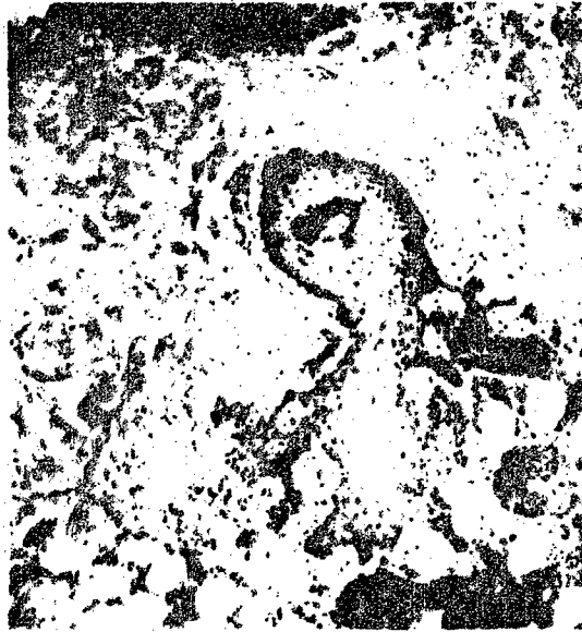
Fig. 1. Growth of epithelium of the external hair sheath of the auto-graft by infiltration in depth. (Irradiated piglet six days after graft; 10 days after irradiation. Staining with hematoxylin-eosin. Magnification 80 X.

supply of nourishing substances to the tissues of the skin flap is inadequate and takes place by means of the diffusion of tissue humors through a layer of inflammatory exudate that has formed between the tissues of the autogenous graft and the recipient. Therefore, in the first days after the transplant some elements of the skin flap undergo dystrophic and necrobiotic changes which are most pronounced in the epithelial cells of the epidermis, in the hair follicles and also in the blood vessels of the autogenous graft. The dystrophic processes were less pronounced in the reticular layer of the autogenous graft, where karyopyknosis of the connective tissue cells, swelling and homogenization of