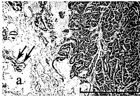
Figure 2 Expression of Brcal antisense in mammary epithelial cells leads to the development of mammary adenocarcinomas. The Panel shows a 5 um histological section of mammary tissue obtained from an BAS female. The right side of the panel shows non transformed mammary tissue including ducts ( arrows) and adipocytes (a). The left side of the panel shows a well developed adenocarcinoma.