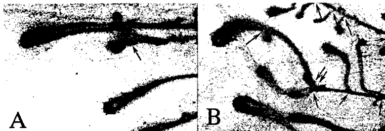
Figure 1 Expression of Brcal antisense in mammary epithelial cells leads to increased branching and hyperplasia. Panel A shows a whole mount preparation a wild-type mammary gland from a 4 week old mouse treated for 7 days with dexamethasone. Panel B shows a similar preparation from a BAS transgenic littermate. Arrows identify branch points which are much more prevalent in the BAS animal.

BAS mice have been in the lab for 2.5 years. Upon dexamethasone treatment, 3 week old BAS females show evidence of mammary hyperplasia with increased numbers of branch points in the mammary tree (Figure 1). Non-treated (dexamethasone free) females develop mammary adenocarcinomas with long latency (6-12 months (Figure 2)). The incidence is low (4/20 mice > 8mo of age). We are currently mating BAS mice into the p53 null background, following the same procedure outlined for the BrKO mice in the original application. The bigenic BAS/p53 colony is still young, but we have observed 4 mammary tumors thus far and are awaiting additional results as the colony ages. The strategy of targeting Brcal antisense appears to be a more effective means of eliminating Brcal expression than waiting for allelic loss at the endogenous Brcal locus. It therefore is a very promising alternative for studying BRCA1 induced tumors.