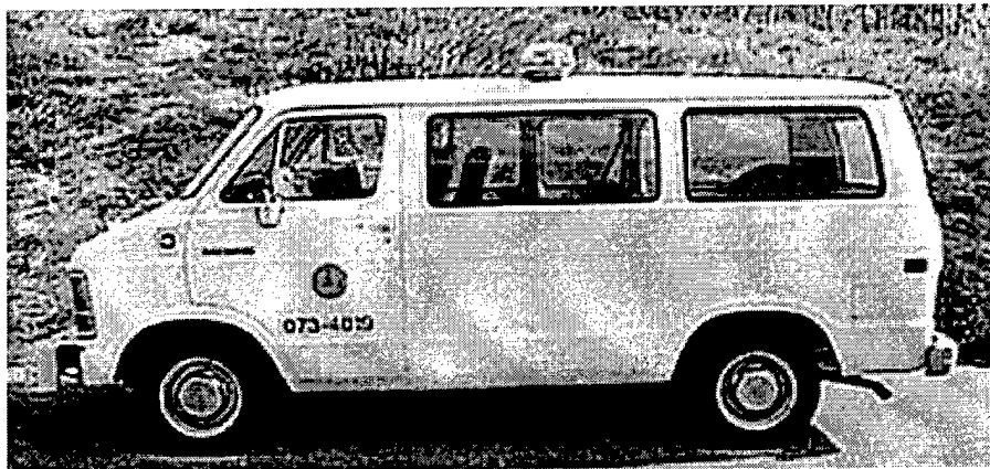
Figure 1: Profiler Vehicle

Height sensors mounted in the front bumper of this Pennsylvania Department of Transportation road profiler send pavement data to an onboard computer for calculating the International Roughness Index.