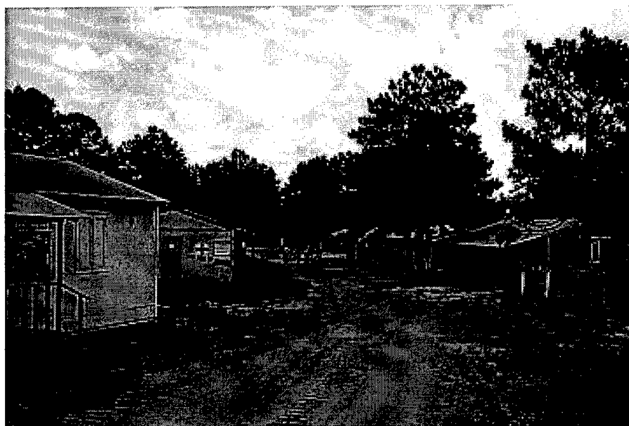
Figure 3: Mock Civilian Village at the Joint Readiness Training Center

The NTC and the CMTC sponsor exercises designed to train armor and mechanized infantry units, such as those from the 1st Armored and 3rd Infantry Divisions, in a high intensity threat environment. The JRTC provides nonmechanized or light forces, such as the 82nd Airborne and the 10th Mountain Divisions, with exercises in a low-to-medium threat environment. Both centers, however, do provide training for task forces made up of heavy and light units operating together. The CMTC and the JRTC also have constructed mock towns for training in urban warfare. Forces from the other military services as well as special operations units are also brought into the exercises at all three centers. Brigades and battalions deploy to these centers with their associated combat service and service support units.