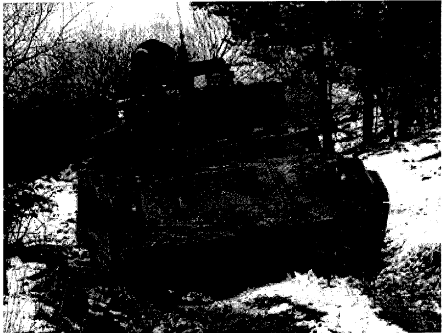
Figure 2: Wooded Terrain at the Combat Maneuver Training Center

The training areas at the Joint Readiness Training Center include swamplands, dense forests, and simulated civilian villages complete with role players, as figure 3 shows.