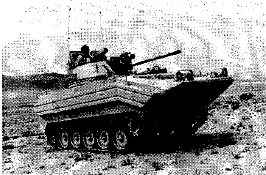
Figure 4: Opposing Force Vehicle and Soldier at the National Training Center

At the NTC and the JRTC, the Army has established pre-positioned stocks of equipment that units draw and use during the exercises. The NTC equipment consists of about 3,800 major pieces of equipment, including tanks, fighting vehicles, artillery pieces, personnel carriers, recovery vehicles, and various types of wheeled vehicles. Generally, units training at the NTC ship their wheeled vehicles and unique equipment items to the center, and they draw their tracked vehicles from the pre-positioned stocks. The pre-positioned equipment at the JRTC consists of about 1,100 major pieces of equipment, mainly wheeled vehicles. Units ship their tracked vehicles to this center for training. The CMTC does not have a pre-positioned stock of equipment.