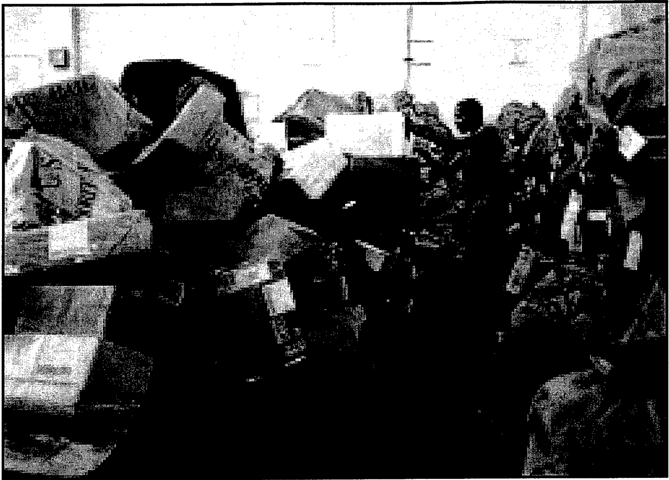
A central mail facility handles the large volume of mail generated during the Gulf War. While mail proved to be a definite morale booster during the Gulf War, as it has in all previous wars or conflicts, it did require a substantial amount of airlift to move.