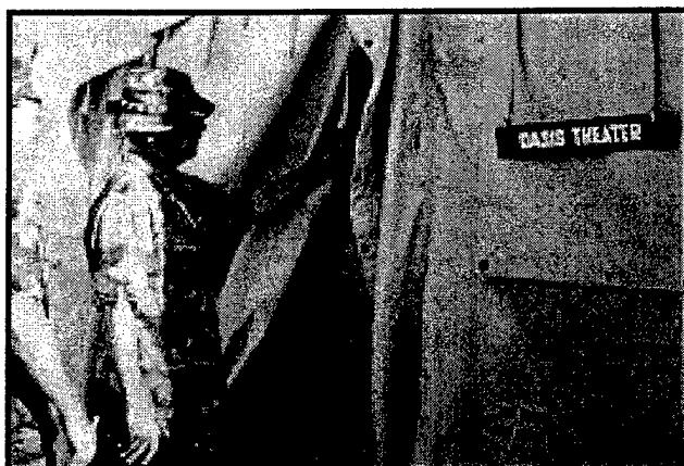
Tent theaters were among the morale, welfare and recreation facilities established to support US personnel during the Gulf War.

Initial Harvest Falcon deployments by the USAF included items to support housekeeping and mission-support operations: lighting sets, washers, dryers, shower and shaving units, portable latrines and electrical cable, for example. This equipment provided for immediate needs and aircraft support. Harvest Falcon assets were designed to support up to 750 aircraft and up to 55,000 personnel. 14