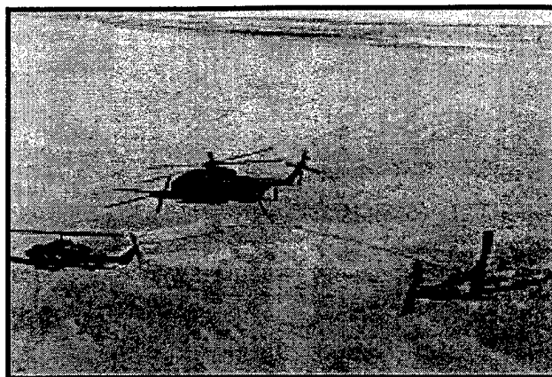
Attack helicopters at a forward location are refueled.

It is important to note that as supplies moved to the Persian Gulf, depots also received new supplies from vendors and manufacturers at an almost equal rate. Shortages of some items such as MREs sometimes required depots to adopt innovative solutions through the use of similar alternative items. For example, Hormel's Top Shelf™ prepackaged meals were issued until MRE stocks could be replenished. 16