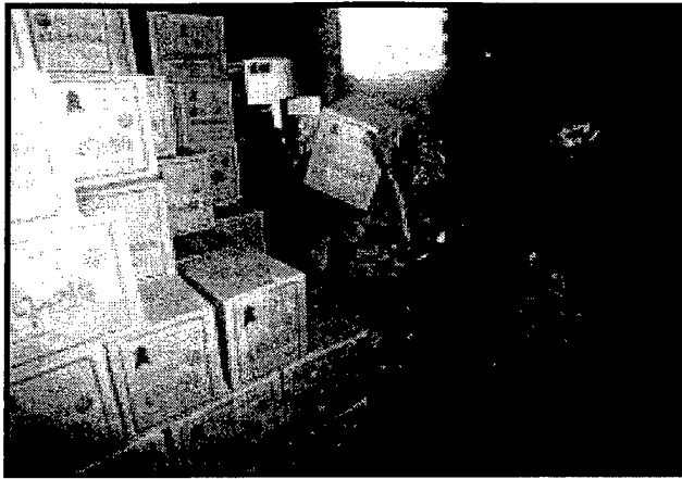
Stocks of potable water have always been a critical factor for military operations and the Gulf War was no exception. In this photo bottled drinking water is moved from central storage to troops in the field.

no way to prepare meals when contracted personnel left the installation after a warning of impending chemical attack was received. This situation was only alleviated when contractor personnel returned and were provided with appropriate protective equipment.