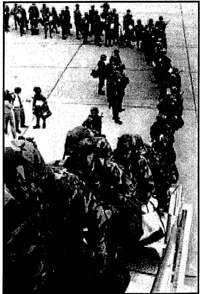
Army troops wearing green battle dress uniforms (BDUs) board an aircraft for deployment to Southwest Asia. Supplies of the desert camouflage uniforms proved to be a problem during much of the Gulf War.

Both the Army and the Marine Corps also had some difficulty with availability and sizing of uniforms, boots and, particularly, chemical defense ensembles. The Air Force experienced many of the same types of problems, but experienced the additional