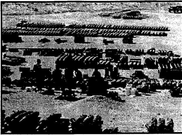
Munitions storage and build-up (assembly) facilities were established in a number of locations during the Gulf War.

General Paul Greenberg, commander of the Armament, Munitions and Chemical Command, the agency which buys munitions for all of the military Services, reported that shortages existed or were anticipated in numerous ammunition categories. The general went on to state that ammunition requisitions from Central Command forces were averaging about 125 percent of the planned consumption rates for a typical ground war. 19