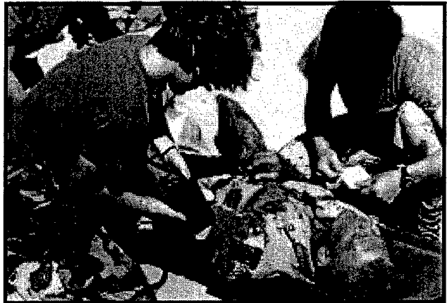
Medical personnel treat a troop overcome by heat exhaustion and dehydration.

provide 20 gallons a day per soldier, sailor, airman and marine, as well as for on-site civilian advisors and contractors. The per-person daily allotment included six gallons for drinking, plus water for cooking, washing, hygiene and vehicle radiators. 6