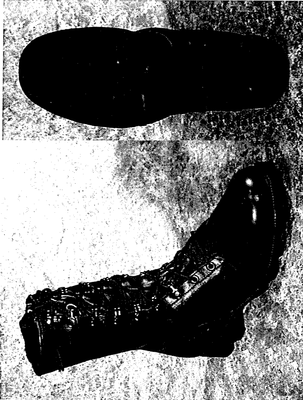
Figure 4. Boot AC - current-issue Army boot, commonly referred to as "Combat Boot"; officially designated as Boot, Combat, Mildew and Water resistant, Direct Molded Sole.