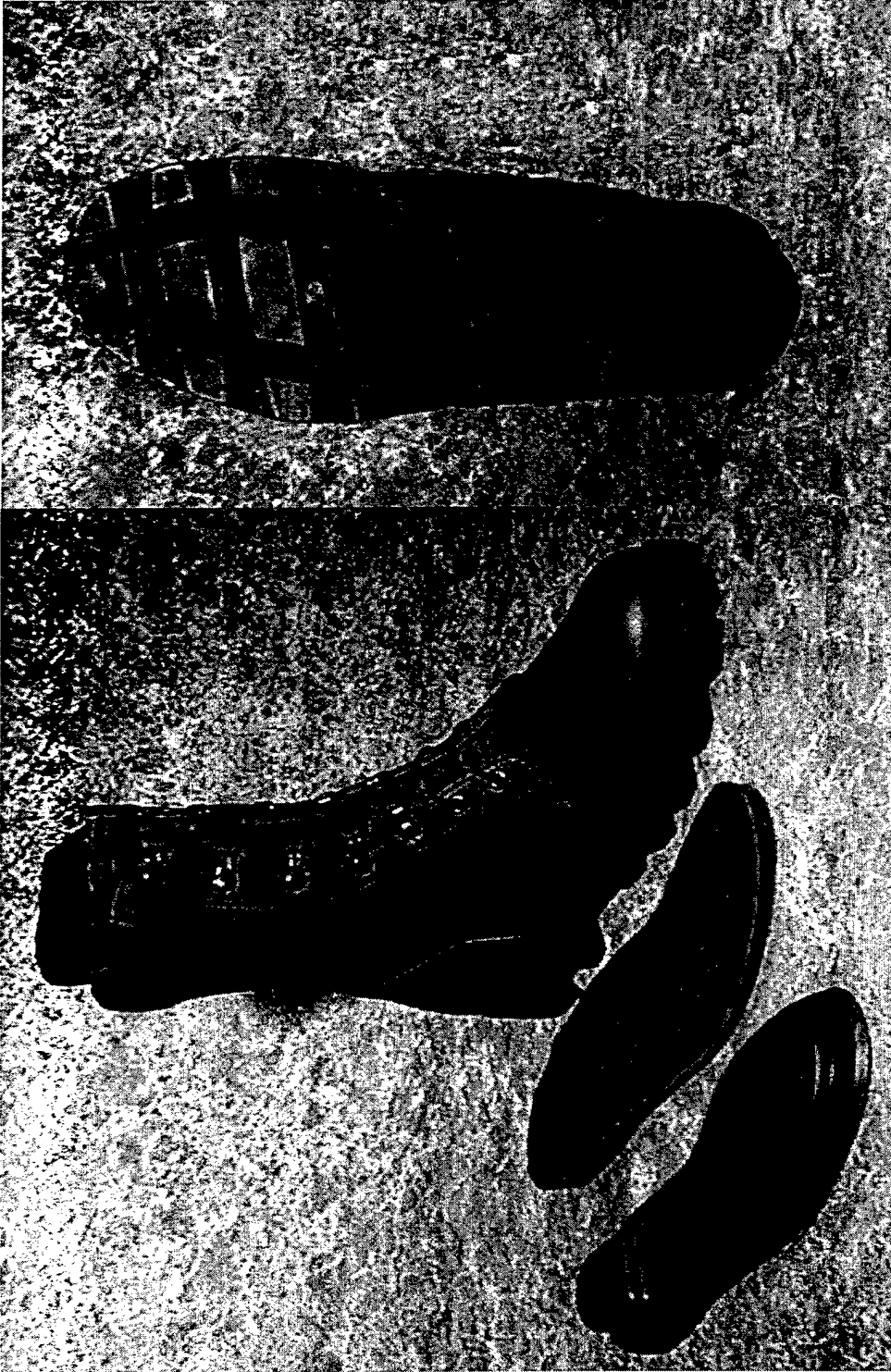
Figure 3. Boot P4 - second generation prototype 4 military boot