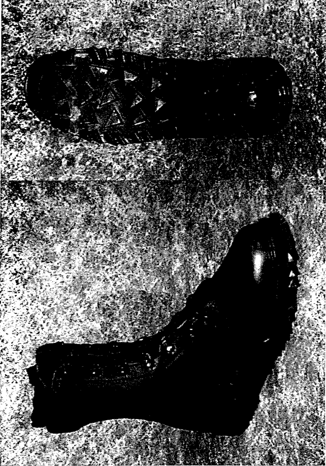
Figure 1. Boot P2 - second generation prototype 2 military boot