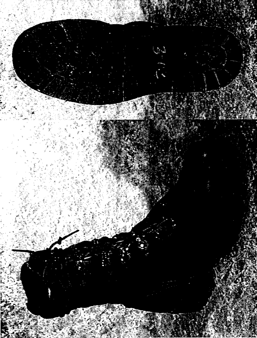
Figure 2. Boot P3 - second generation prototype 3 military boot