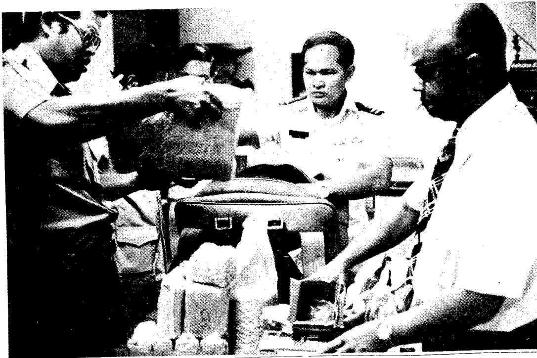
Photo shows Customs officials at Don Muang Airport this morning examining the neatly packed 14 kilogrammes of No 3 heroin from the bag. The drug was addressed to Amsterdam in the Netherlands where the punishment for narcotics possession is very light.

The report said the villagers had grown marihuana in deep jungle.