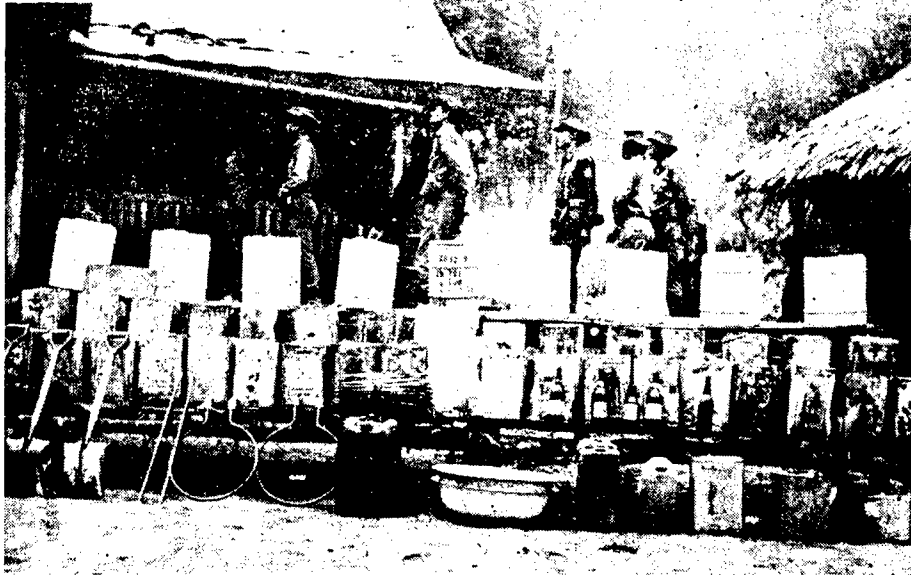
Picture shows various chemicals used in refining heroin and smuggled goods which were seized from the insurgents at Man Ton Camp.