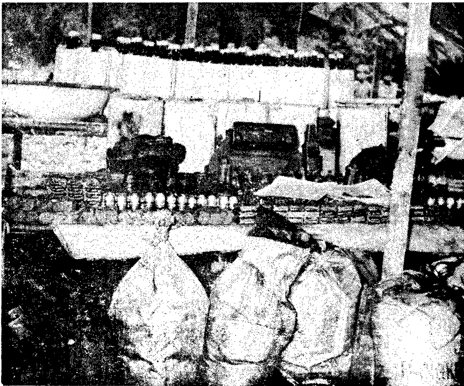
Picture shows chemicals used in refining heroin and assorted weapons and ammunition captured from the insurgents' Kuang Mai Hung opium refinery camp by the army. Some arms and ammunition belonging to the Thai armed forces, who had intruded into Burmese territory, are also shown in the picture.