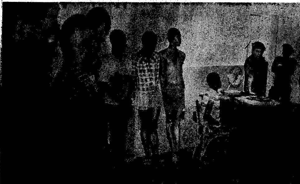
White man relied on cocaine ring for amount of 2 million cruzeiros