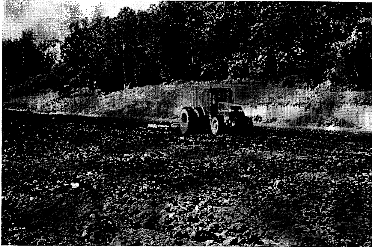
Figure 4. Typical land treatment equipment