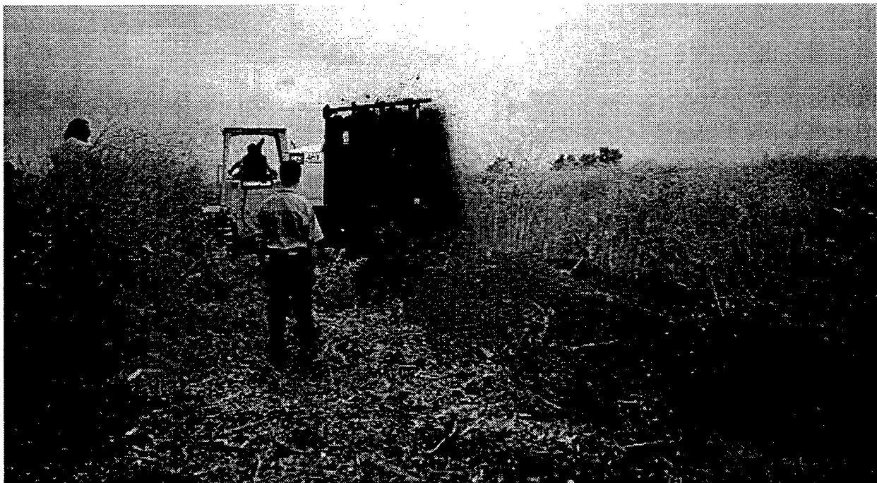
Figure 1. Turning of compost windrows at the Jones Island CDF, Milwaukee, WI (from Myers and Bowman 1999)

Three process designs are used in composting: mechanically agitated in-vessel composting (compost is placed in a reactor vessel where it is mixed and aerated), windrow composting (compost is placed in long piles known as windrows and periodically mixed with mobile equipment), and aerated static pile composting (compost is formed into piles and aerated with blowers or vacuum pumps). Windrow composting (Figure 1) is usually considered to be the most cost-effective composting alternative. It also may have the highest fugitive gas emissions.